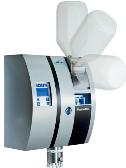
Clean filling system

also provides improved working hygiene – nothing is spilt to get into the air ways. Eltosch Graftix refill bottles of high-quality powders are available in 750g and 1500g bottles.